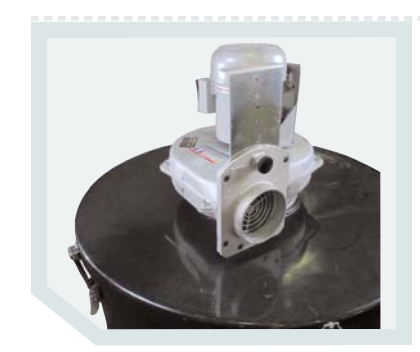
CLOSE-UP OF BLOWER WITH ADJUSTABLE DAMPER

CONSTRUCTION: The DS-300's polyethylene canister measures 31 inches (78.7 cm) in diameter, 72 inches (182.8 cm) in height (including blower), and 1/4-inch (6.4 mm) in thickness.