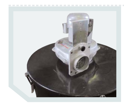
CLOSE-UP OF BLOWER WITH ADJUSTABLE DAMPER

CONSTRUCTION: The DS-100's polyethylene canister measures 22 inches (55.9 cm) in diameter, 60 inches (152.4 cm) in height (including blower), and 1/4-inch (6.4 mm) in thickness.